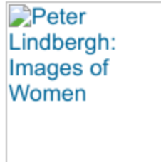
Peter Lindbergh: Images of Women $53.15

Unless otherwise noted, items sold by Amazon.com LLC are subject to sales tax in select states in accordance with the applicable laws of that state. If your order contains one or more items from a seller other than Amazon.com LLC, it may be subject to state and local sales tax, depending upon the sellers business policies and the location of their operations. Learn more about tax and seller information .